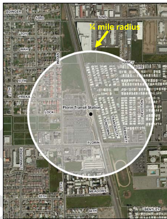
Figure SA-FTV 1: Florin Transit Village Plan area (1/4 mile radius from station)